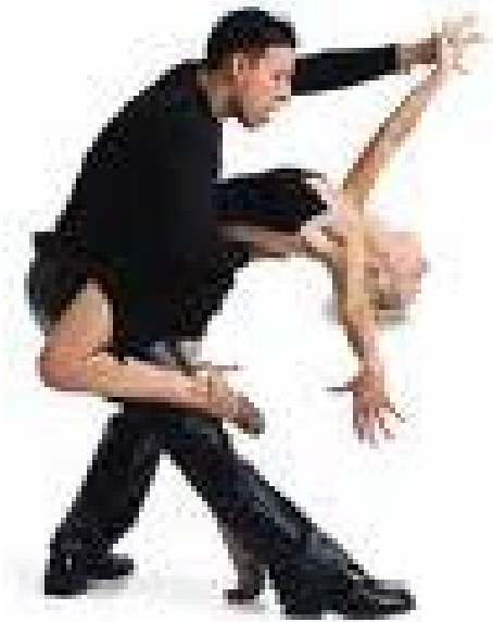
Dancing w/ the Stars